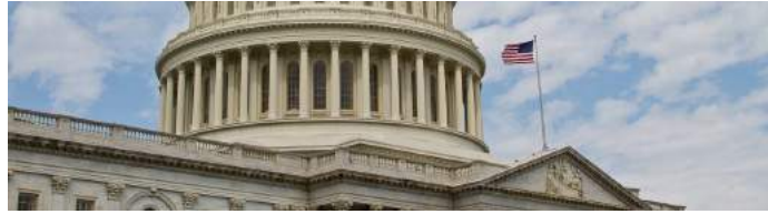
Legislative Days 28 Feb—2 Mar 2019